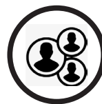
À La Carte