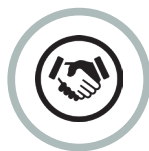
Program of Study Partner